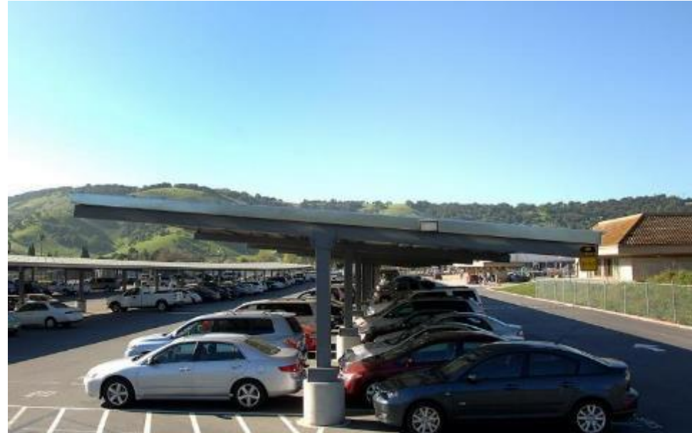
T-Structure Parking Canopy