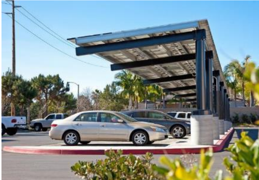
L-Structure Parking Canopy